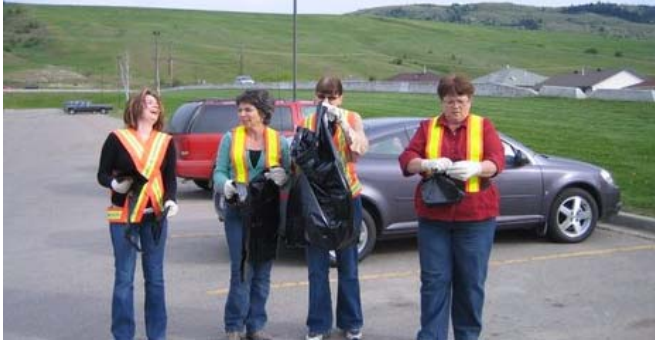
Working hard in our fashionable high vis vests!